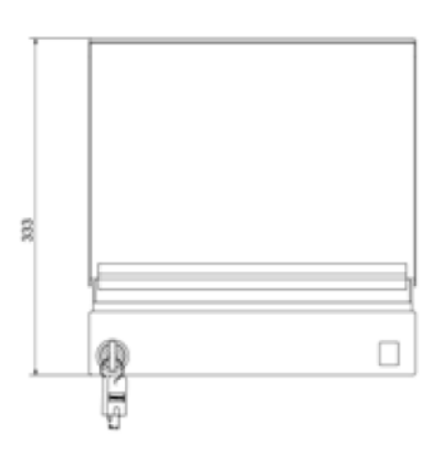
Safetell 322mm Flip Top Tills