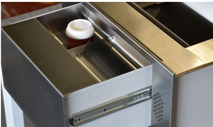
Tray insert with large coffee cup holder and cash tray.