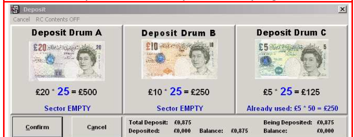
Multiple Deposit Window with visual instruction of which currency to deposit in which Drum